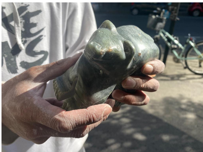
An Inuk community member sharing their completed stone carving of a polar bear. (2021)

The Ka'wáhse Street Patrol provides supplies, information, support, and referral services to Indigenous and non-Indigenous homeless people living within downtown Montréal. The Patrol's objective is to alleviate the hardships faced by those experiencing instability and improve the living conditions of those at risk of violence and abuse while on the streets. Due to the necessary restrictions imposed during the pandemic, the Ka'wáhse Street Patrol was unable to operate their regular programming. Such programming includes the 'centre de soir' which offers community members the opportunity to socialize and find comfort in a warm and culturally-appropriate environment.