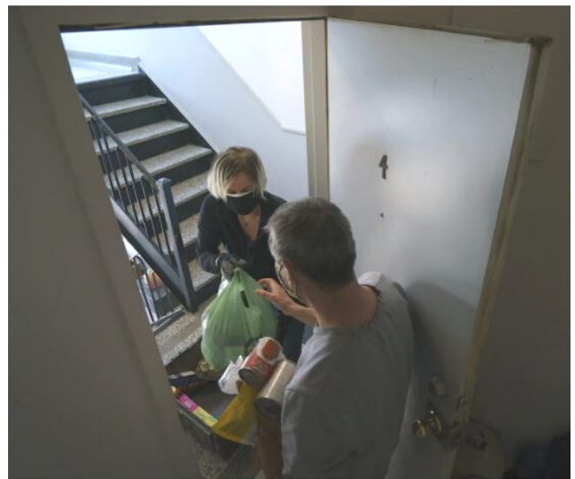
An Outreach Worker from the Niawen'kó:wa Food Security Program delivers a food basket to a community member. (2021)

With the support of our team members and our affiliated partners Moisson Montréal, Santropol Roulant, la Tablée des Chefs, and Horizon Nature, Niawen'kó:wa empowers community members to develop resilient minds and nourished bodies by increasing food security.