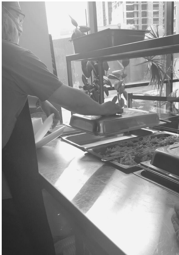
Our cook serving a hot lunch meal for a community member. (2021)

To support our mission during the period of 01 April 2020 to 31 March 2021, Moisson Montréal distributed 30 890 kilograms of food to the NFCM. This represents a value of $178 235, 93. They also donated 120 Christmas baskets to our organization during the holiday season for distribution within our community.