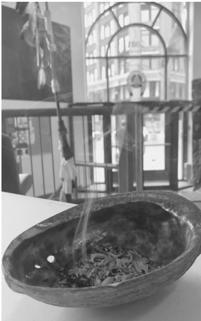
An abalone shell burning sage during a smudging ceremony in the Kaie:ri nikawera: ke Day Centre. (2021)

The Native Friendship Centre of Montréal Inc. (NFCM) is collaborating with Health Canada to continue providing emotional and cultural support services to former Indian Residential School System (IRSS) students and their families before, during, and after participation in Settlement Agreement (SA) processes, including Common Experience Payments (CEP) and the Independent Assessment Process (IAP), as well as those who participated in Truth and Reconciliation Commission events and Commemoration activities.