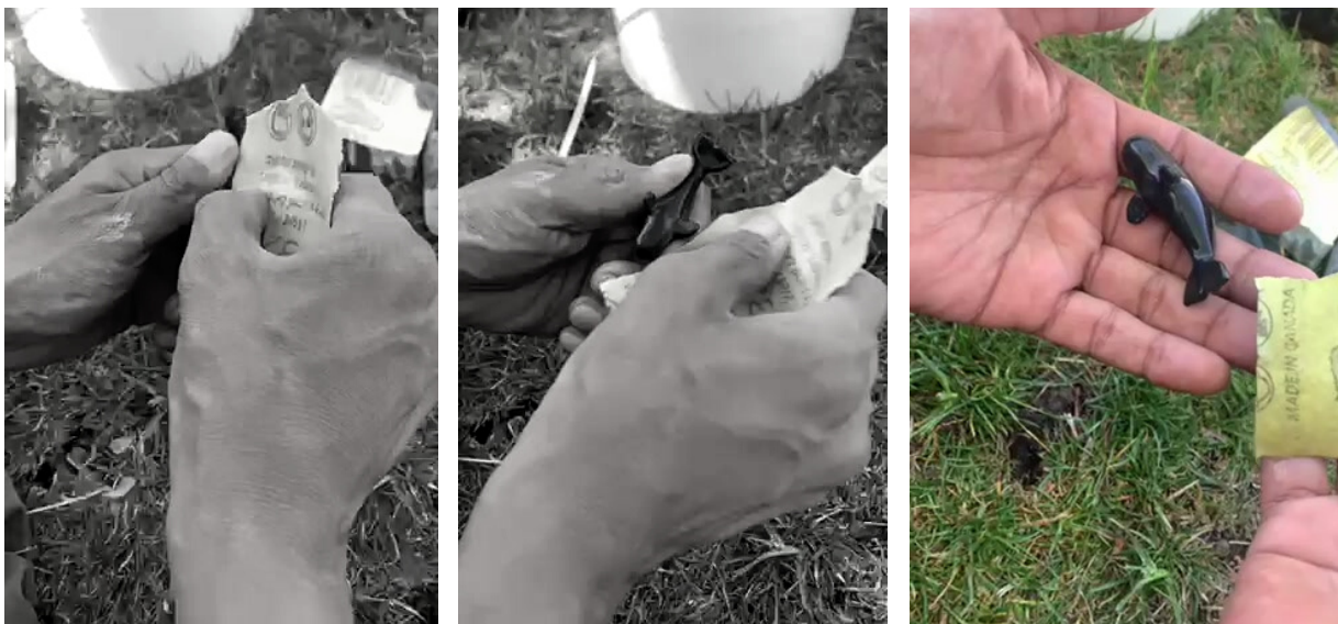
An Inuk community member sharing his stone carving of a whale while also demonstrating the carving process. (2020)

NFCM will examine strategies and approaches to meet the challenges and needs of our membership base including youth, families, students, adults, and Elders.