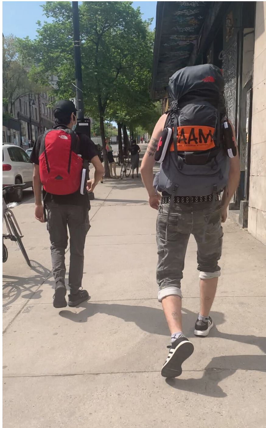
Ka'wáhse Street Patrol Intervention Workers while on foot patrol. (2021)